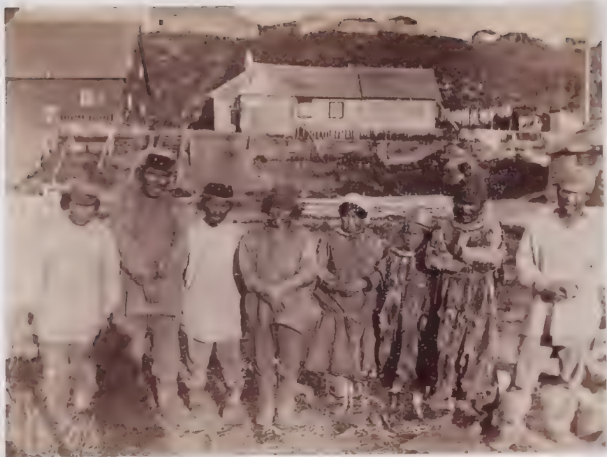
Group of Natives from Upper Mushayan River